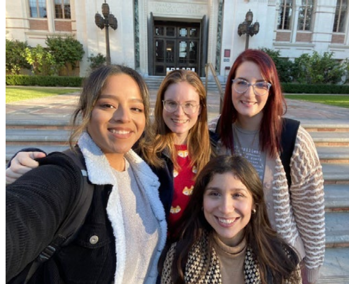
Our MMLIS students regularly meet to study together on campus!

Congratulations! We look forward to seeing what the chapter can do this year!